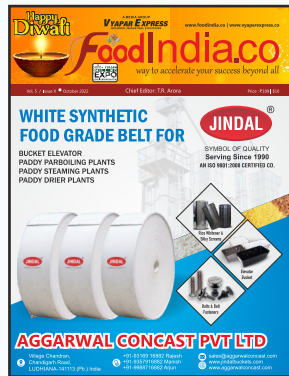
FOODINDIA.CO MONTHLY MAGAZINE