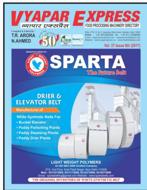
GRAIN PROCESSING MACHINERY DIRECTORY