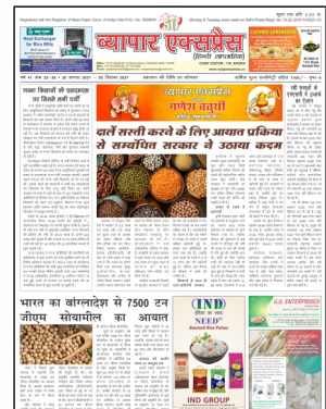
VYAPAR EXPRESS WEEKLY NEWSPAPER