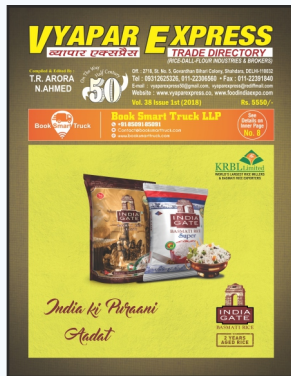
VYAPAR EXPRESS FOOD INDIA DIRECTORY

FOOD INDIA DIRECTORY | FOOD INDIA GRAIN BROKERS & MILLERS DIRECTORY FOOD INDIA WHOLESALE MERCHANTS DIRECTORY | FOOD INDIA EXPORTERS & IMPORTERS DIRECTORY FOOD INDIA GRAIN PROCESSING MACHINERY DIRECTORY | FOOD INDIA PACKAGING DIRECTORY