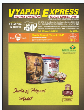
VYAPAR EXPRESS FOOD INDIA DIRECTORY

FOOD INDIA DIRECTORY | FOOD INDIA GRAIN BROKERS & MILLERS DIRECTORY FOOD INDIA WHOLESALE MERCHANTS DIRECTORY | FOOD INDIA EXPORTERS & IMPORTERS DIRECTORY FOOD INDIA GRAIN PROCESSING MACHINERY DIRECTORY | FOOD INDIA PACKAGING DIRECTORY