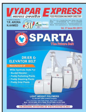
GRAIN PROCESSING MACHINERY DIRECTORY