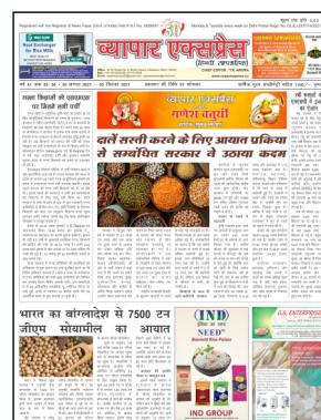
VYAPAR EXPRESS WEEKLY NEWSPAPER