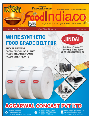
FOODINDIA.CO MONTHLY MAGAZINE